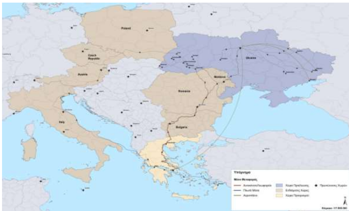
Map 1 Migration routes from Ukraine to Greece: 1990-2011